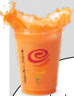
Jamba Juice Fundraiser

We are now selling healthy fruit smoothies in front of the library every Wednesday when school gets out as a fundraiser. They cost $4 each and you can choose between either Mango or Strawberry.